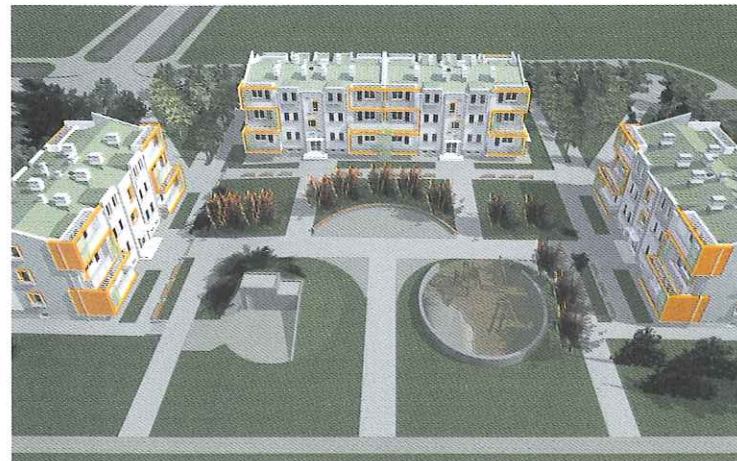
Slika 4: Blok 24 3D Modeli Objekti B, C, A1

Choice of plant species was done according to environmental conditions, terrain configuration, and purpose of tree areas. Species of different greenery categories were chosen that completely satisfy functionality, sanitary-hygienic and esthetic role. Proposed species satisfactorily are existing in mentioned environmental conditions.